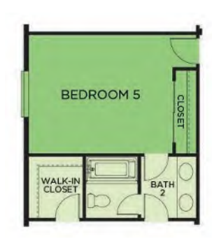
OPT. BEDROOM 5